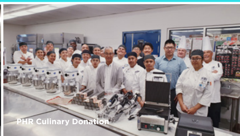
PHR Culinary Donation