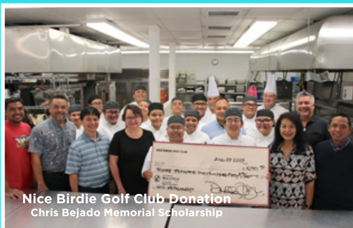
Nice Birdie Golf Club Donation Chris Bejado Memorial Scholarship

For the 12th year, TakeCare Inc. has donated $100,000 to the GCC Allied Health Department to fund instructional equipment, supplies, and faculty professional development for GCC health care programs.