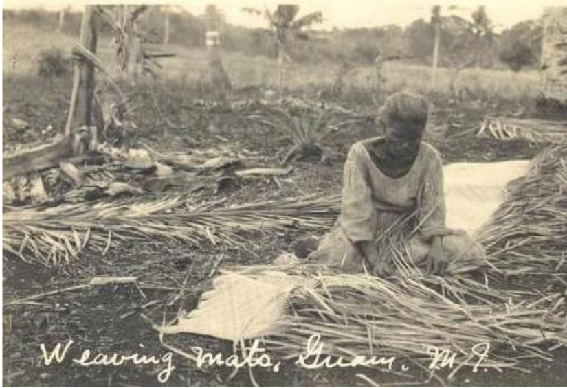
Weaving mats, Guam, M. I.