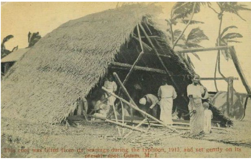
This roof was lifted from its bearings during the typhoon, 1913, and set gently on its present spot. Guam, M. I.