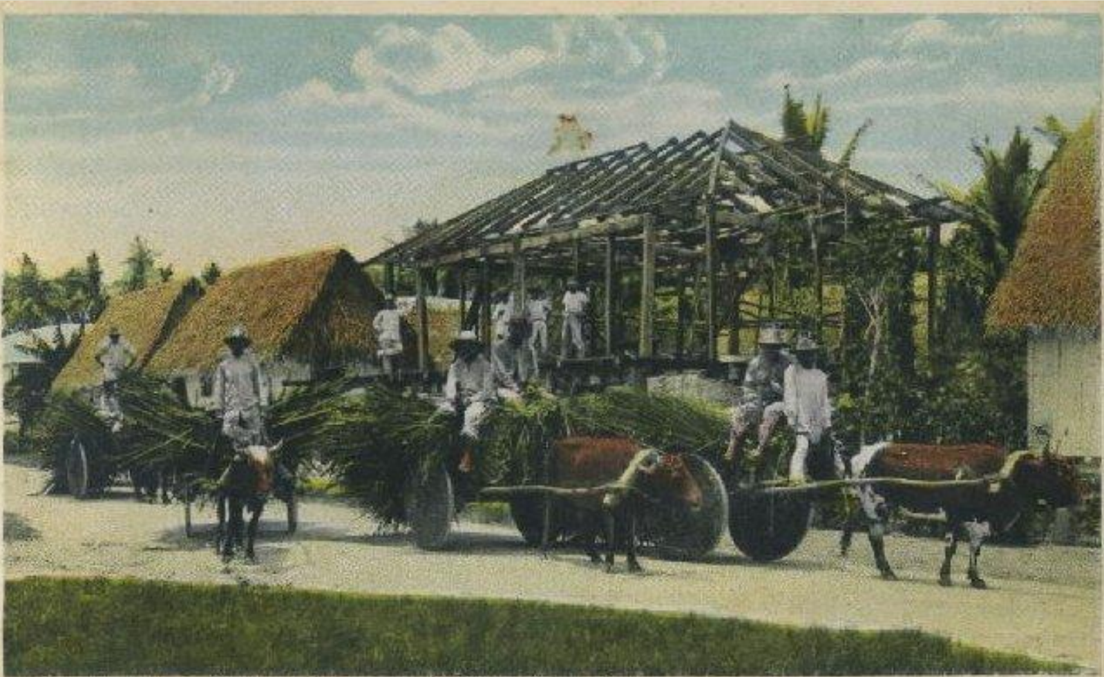
BRINGING IN COCONUT LEAVES FOR ROOFING, GUAM, M. I.