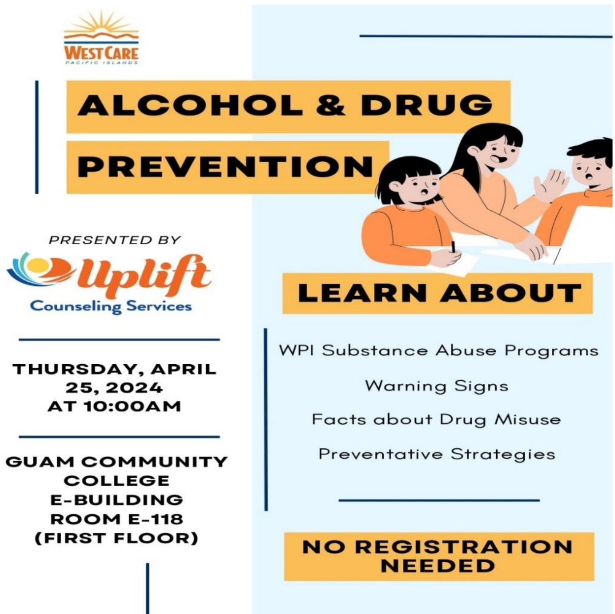
Figure 9. The DAAPP in collaboration with WestCare Pacific Islands Foundation and held an on-campus Alcohol & Drug Prevention Awareness.

In July 2024, the DAAPP collaborated with the Guam Behavioral Health & Wellness Center to offer training on twenty topics including drugs, alcohol, substance abuse, suicide, and mental health. These training opportunities are available to staff, faculty, and students.