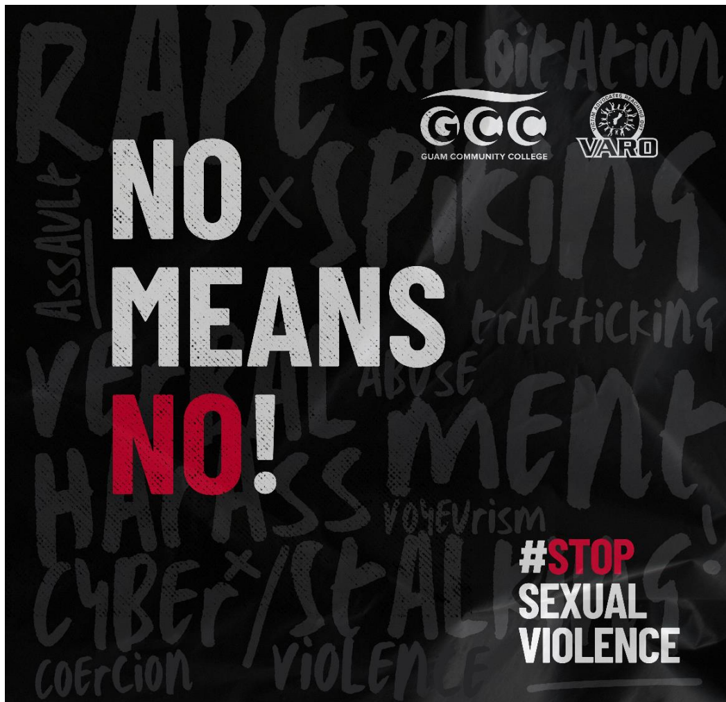
Figure 10. The Sexual Assault Response Team's awareness information is posted throughout the campus for students and employees. It is also available on https://guamcc.edu/CampusSafety .