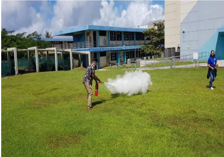
Figure 2. Fire Extinguisher Training for our college employees presented by the Environmental Health & Safety Office in July 2024.

In collaboration with Guam Department of Labor, OSHA On-Site Consultation, a Fall Protection Training was conducted in July 2024 for employees to be better prepared in the workplace.