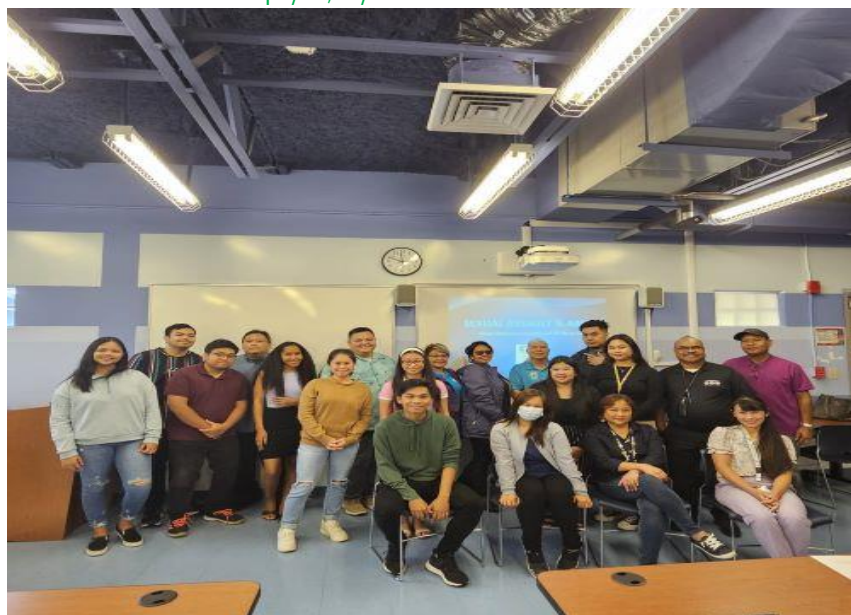
Figure 7. Guam Community College Sexual Assault Response Team and Guam Behavioral Health & Wellness Center, Healing Heart Crisis Center presented "Sexual Assault & Abuse Overview" awareness event to employees, July 2024.