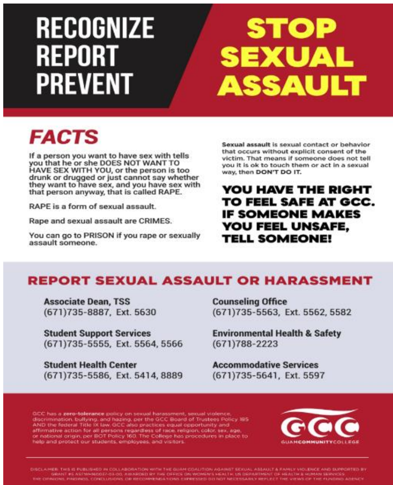
Figure 8. Sexual Harassment and Title IX information.