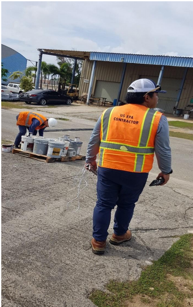
Figure 3. Environmental Health & Safety Office collaborated with the United States Environmental Protection Agency (US EPA). US EPA contractor picked up hazardous chemical waste, March 2024.

In March 2024, the Environmental Health & Safety office (EHS) collaborated with a United States Environmental Protection Agency contractor on the removal of hazardous chemical waste on the campus.