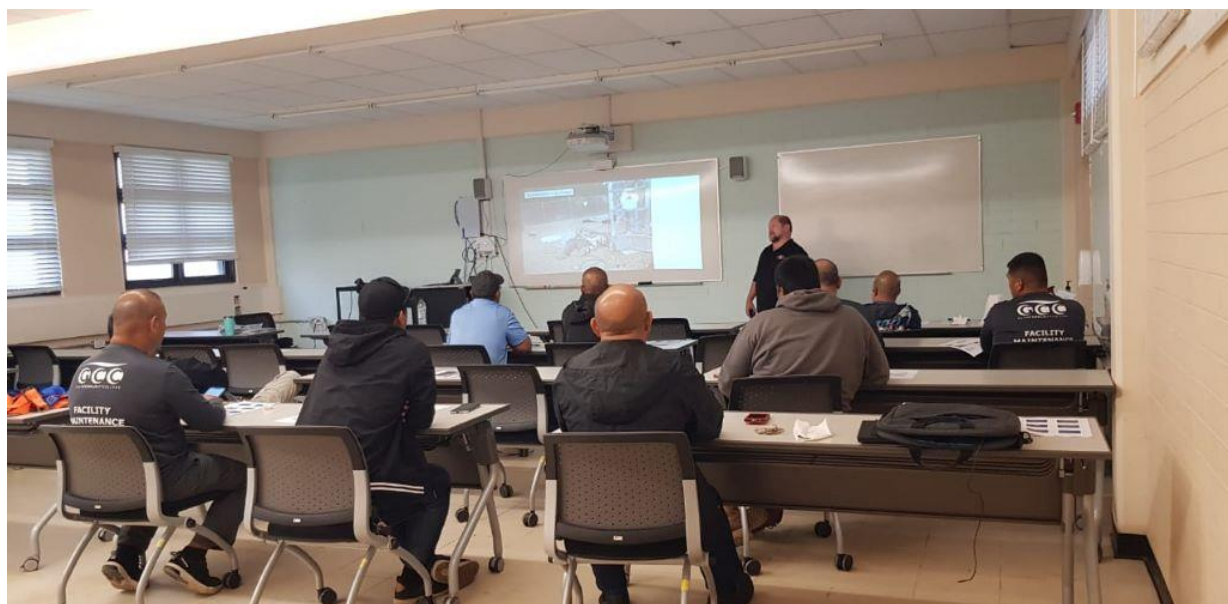
Figure 6. Guam Community College, Environmental Health & Safety and the Guam Department of Labor, OSHA, conducted workplace safety on protective measures and emergency response tips training for employees, July 2024.