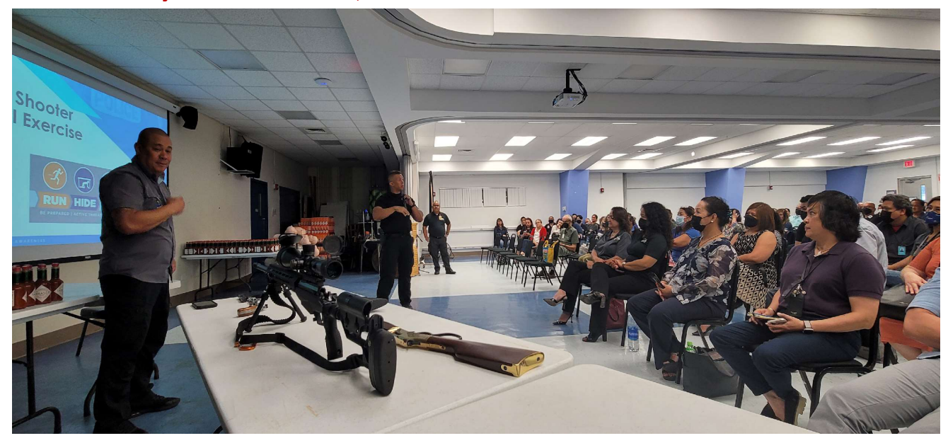
Figure 1. Active Shooter Awareness/Training presented by the Environmental Health & Safety Office and Guam Homeland Security/Office of Civil Defense, November 2022.

The Office of Communications & Promotions posts announcement on fire and earthquake drills on the College's webpage accessible to students, faculty, and staff. An Active Shooter training is also made available on the College webpage for students, faculty and staff to be prepared in case of an Active Shooter incident.