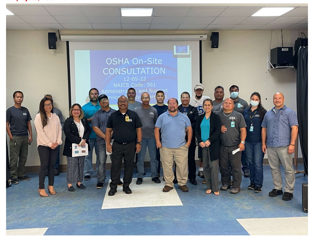
Figure 5. Guam Community College, Environmental Health & Safety and the Guam Department of Labor, OSHA, conducted workplace safety on protective measures and emergency response tips training for employees, December 2022.

Public Information Officer. An announcement to all students and employees will then be made on MyGCC, providing exact electronic address to the ASR, and an advisement that a paper copy will be provided upon request.