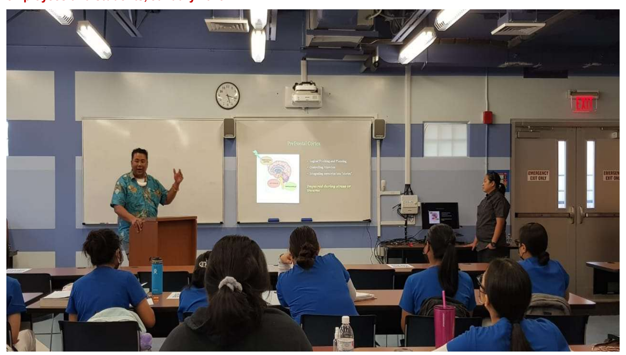
Figure 6. Guam Community College Sexual Assault Response Team and Guam Police Department Domestic Assault Response Team presented "Justice Begins with Trauma Informed Approach" an awareness event to employees and students, January 2023.