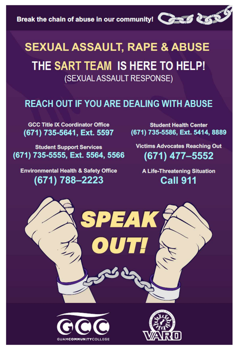
Figure 8. The Sexual Assault Response Team's awareness information is posted throughout the campus for students and employees. It is also available on https://guamcc.edu/CampusSafety.

The Title IX Coordinator is responsible for monitoring that GCC is compliant with all Title IX and federal policies regarding Sexual Discrimination.