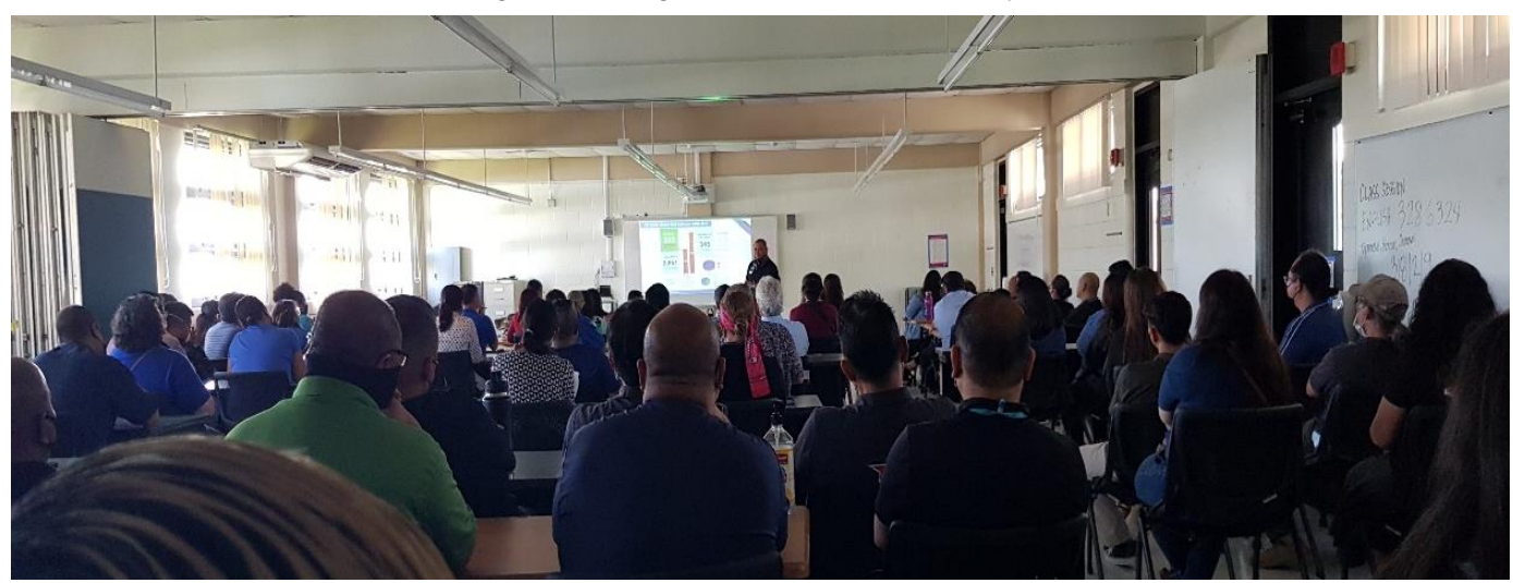
Figure 1. Active Shooter Awareness/Training presented by the Environmental Health & Safety Office and Guam Homeland Security/Office of Civil Defense.

Training sessions on Active Shooter and natural disaster (storms or typhoons) awareness/trainings for employees were hosted by the Environmental Health & Safety Office in partnership with the Guam Home Security/Office of Civil Defense and