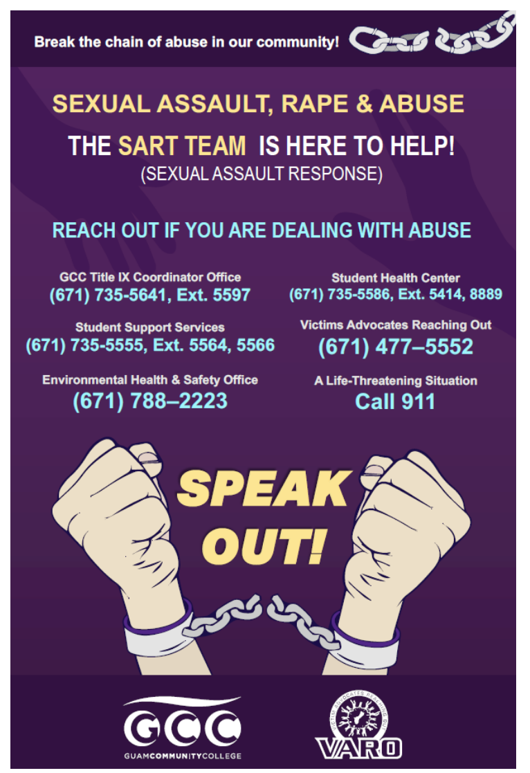
Figure 6. The Sexual Assault Response Team's awareness information is posted throughout the campus for students and employees. It is also available on <u>https://guamcc.edu/CampusSafety</u>.