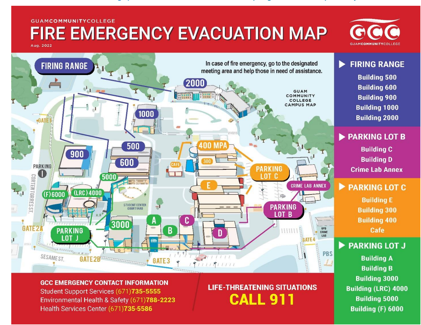
Figure 4. The Fire Emergency Evacuation Map is posted throughout the campus for students and employees' information, such as classrooms, labs, auto and carpentry shops, Learning Resources Center, Student Center, Health Services Center, Book Store, employees' offices, GCC café, Student Lounge, conference rooms and other meeting spaces. It is also available online at https://guamcc.edu/CampusSafety.