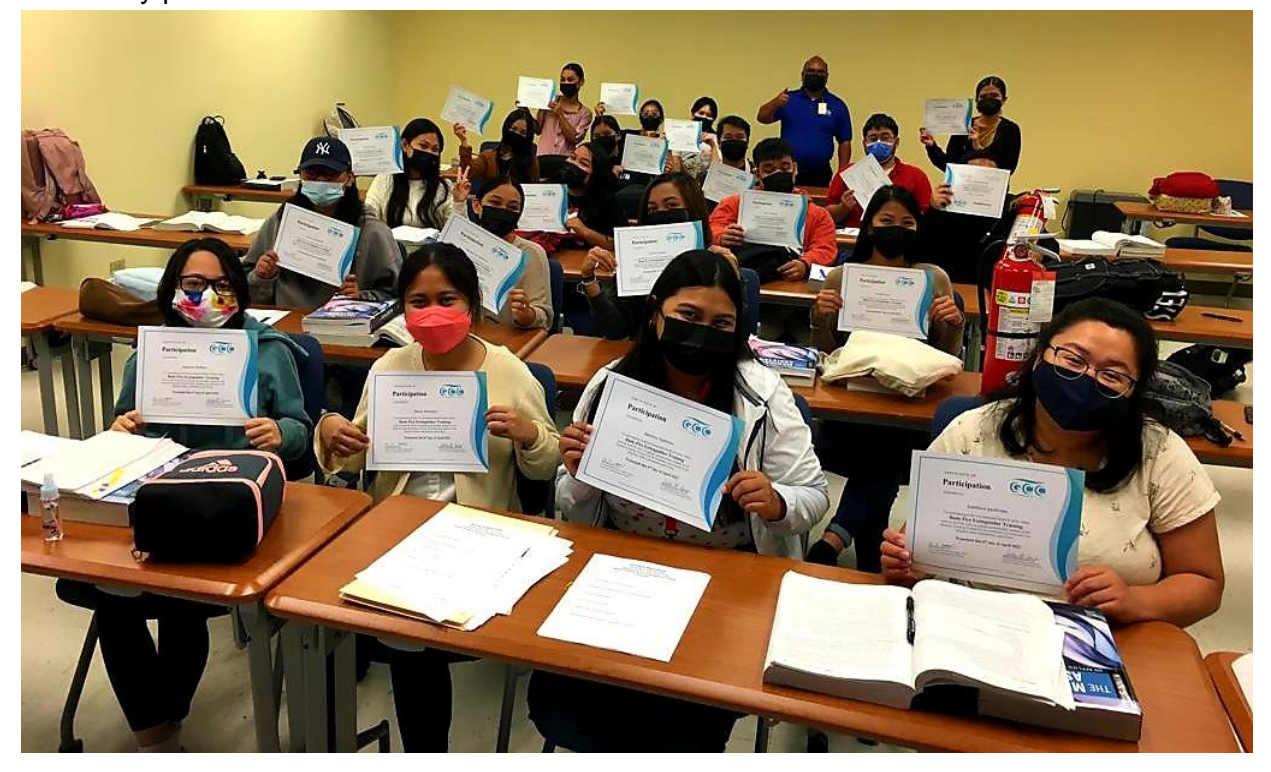
Figure 2. Fire Extinguisher Training for the Allied Health Nursing students presented by the Environmental Health & Safety Office

The EHSO will also conduct a fire extinguisher training for employees in October 2022.