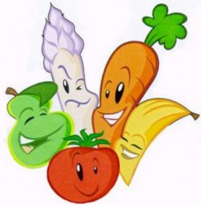
Valuable food waste collected by the GCC Culinary Arts program

Food waste collection is limited to Food Vendors and the GCC Culinary Arts Program. Among collected food waste include fruit and vegetable scraps, cooked/canned/dried/dehydrated meat, coffee grinds, breads, pastries, and all other (cooked) left over food. No raw meat or dairy products should be included in food waste collection bins.