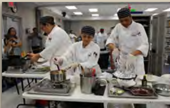
Sanchez ProStart team