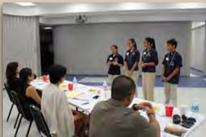
Okkodo LMP team