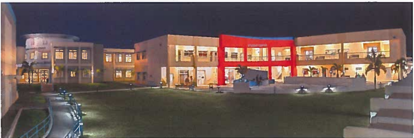
A night photo taken of GCC's Student Center and Learning Resource Center