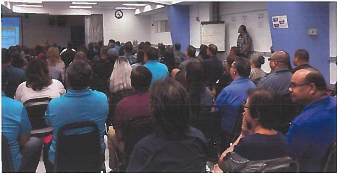
2020-2026 ISMP Planning Session