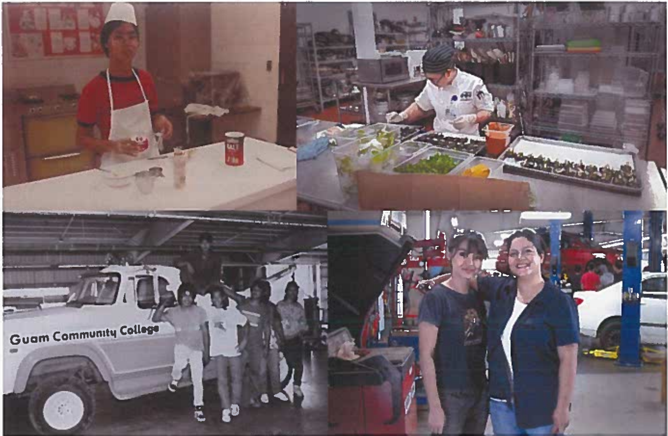
Then and Now Photos of GCC's Culinary Arts and Automotive Programs