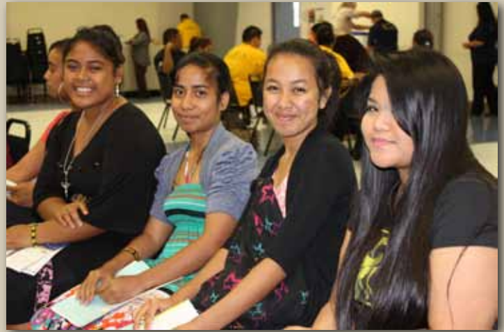
New Student Orientation

Express Registration for spring semester took place from Jan. 8 – 11, allowing 275 students to register for classes. 177 students attended New Student Orientation on January 15th, at 9 AM and 1 PM. In all, 2,428 students are attending GCC for spring semester 2013! Welcome back students!